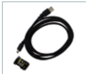
IR connectivity kit