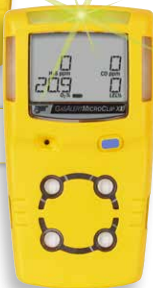
GasAlert MicroClip XL

NEW! GasAlertMicroClip X3 and GasAlertMicroClip XL now feature IP68 for maximum water and dust protection — up to 45 minutes at a depth of 1.2 m.