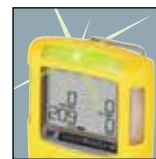
Easy to See

Use our unique advanced technology for safety, compliance and productivity.