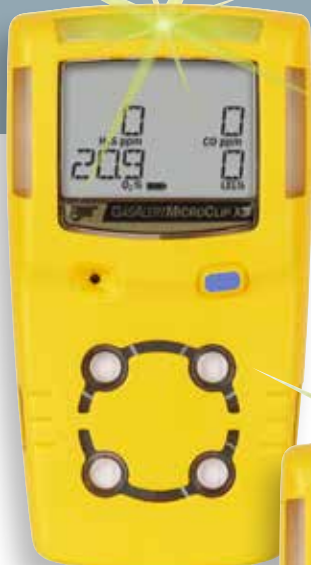
GasAlert MicroClip X3

Guaranteed to run for an entire shift — even in harsh weather.