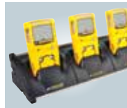
Five unit cradle charger

For a complete list of kits and accessories, please contact BW Technologies by Honeywell.