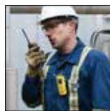
Easy To Wear