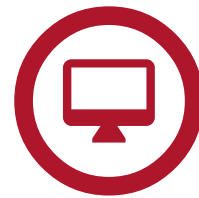
Blackline Live™ web portal