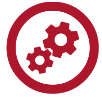
Easy inlet configuration