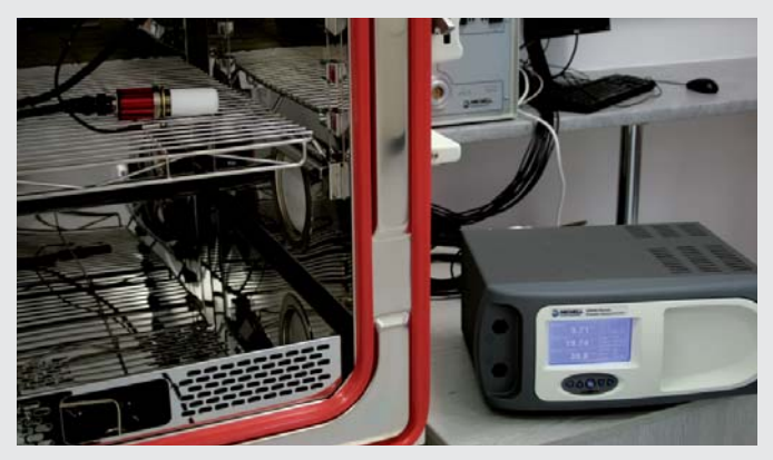
Application: Climatic chamber monitoring

For more challenging applications, where direct insertion is not possible, the sensor can be mounted in a sample block and included in a sampling system. This means that the product can be used for a wide range of applications, and with trace heating - including those up to dew-point temperatures of +90^{\circ} C.