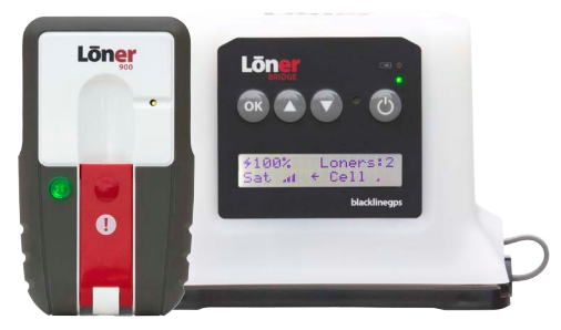
The Loner Bridge System is comprised of Loner Bridge and Loner 900