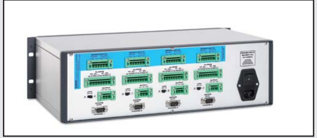
Channel connectors on back of MCU

Liquidew I.S. is available in a multi-channel format (MCU). This MCU enables up to four measurement channels within a single 19" sub-rack unit. The sister product for moisture in gas analysis, Promet I.S., can be combined together with Liquidew I.S. into an MCU to enable both gas and liquid samples measurement with a single analyzer system. With the MCU, each measurement channel functions independently, so that any maintenance on one channel will not affect the others. Customers can also order blank channels for future expansion.