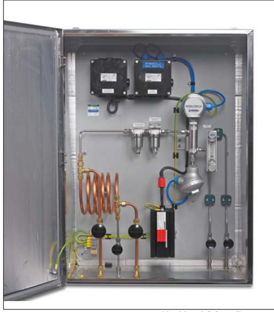
Liquidew I.S Sampling system

The design of the Liquidew I.S. Premium Sampling System has drawn on Michell's 35 years of expertise in on-line process gas analyzers. Particulate filtration is provided in single or dual stages so that sensor and system performance is maintained even in processes prone to contamination. A panel-mounted version of the sampling system and sensor are offered for internal installations, while various enclosures and heating options are available for field installation next to the sample source. Sample cooling, using a water heat exchanger, is available for process fluids at elevated temperature.