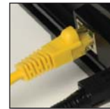
Easy to Network