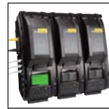
Easy to Expand